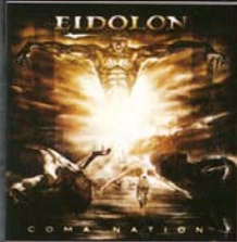
EIDOLON "Coma Nation"