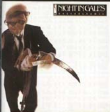
NIGHT IN GALES "Necrodynamic"