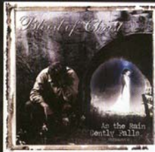
BLOOD OF CHRIST "As the Rain Gently Falls"