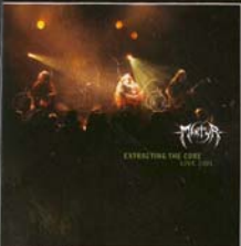
MARTYR "Extracting the Core"