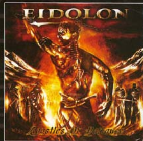
EIDOLON Apostles of Defiance