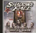
17 Mosh-Pit Pleasers!