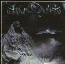
SOUL OF DARKNESS "Cry of the Inner Pain"