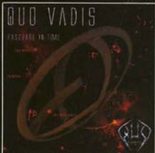
QUO VADIS "Passage in Time"