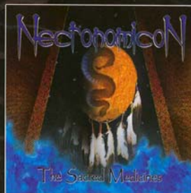
NECRONOMICON The Sacred Medicines