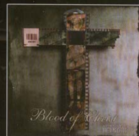
BLOOD OF CHRIST Breeding Chaos