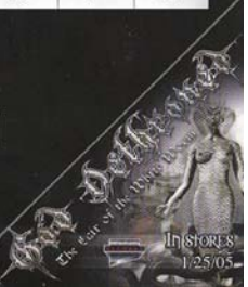
IN STORES 1.25/05

SIX FEET UNDER ✕ PIG DESTROYER ✕ INCANTATION JAG PANZER ✕ HANKER ✕ QUO VADIS ✕ MESHUGGAH THE CHASM ✕ SONATA ARCTICA ✕ UNEARTH